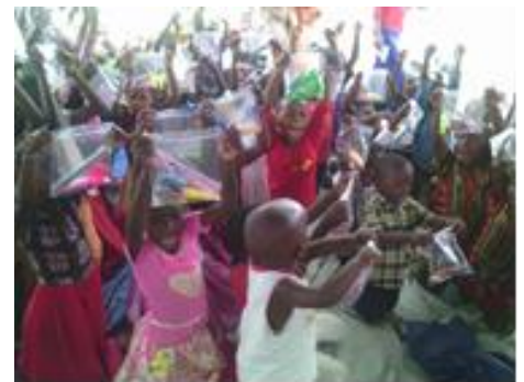
Waiting for Santa